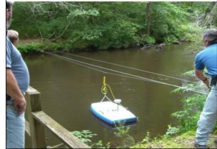
River surveyor taking Doppler flow measurements