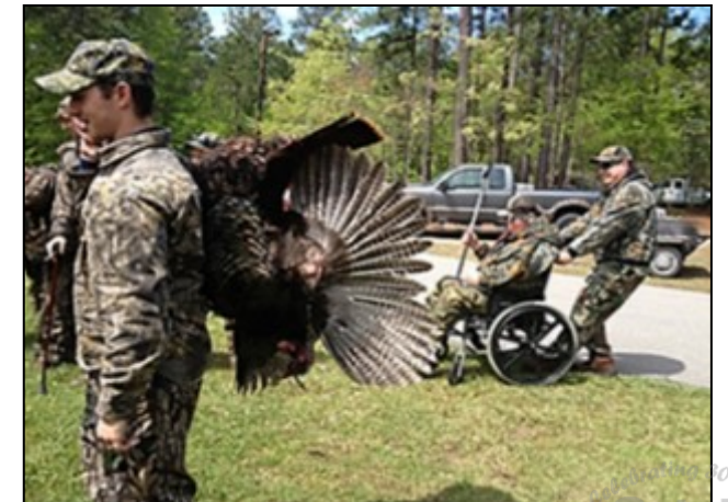
Monitoring of Turkey from Wounded Warrior Hunt