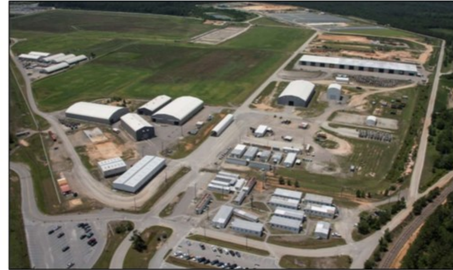
Operational waste management facilities in E Area